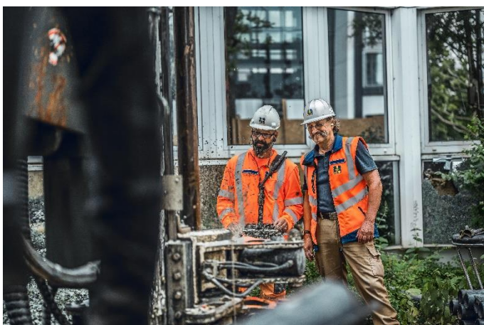
(2) In total, the system can generate more than 200 kW of power.